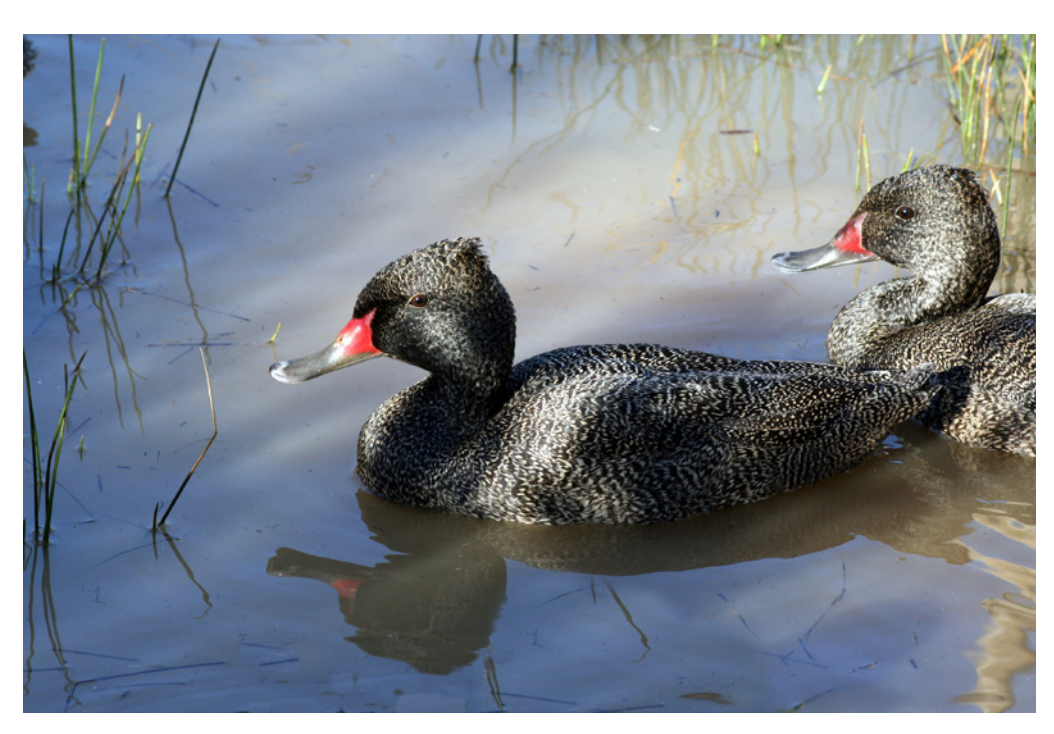
Figure 2.9.4. Freckled Duck (Stictonetta naevosa).

Grey Teal (Anas gracilis), Chestnut Teal (Anas castanea), Pacific Black Duck (Anas superciliosa) and the introduced Mallard (Anas platyrhynchos) are typical dabbling ducks, feeding on the surface of the water on small aquatic animals, floating seeds or stripping seeds from over-reaching grasses and other plants. They are also frequently seen up-ending with the tail sticking out of the water feeding on submerged plants and small mud dwelling animals, which they sift through their bills. They occur in a wide variety of wetlands from large permanent wetlands, rivers, ponds, farm dams and, especially the Chestnut Teal, in coastal waters including bays and estuaries.