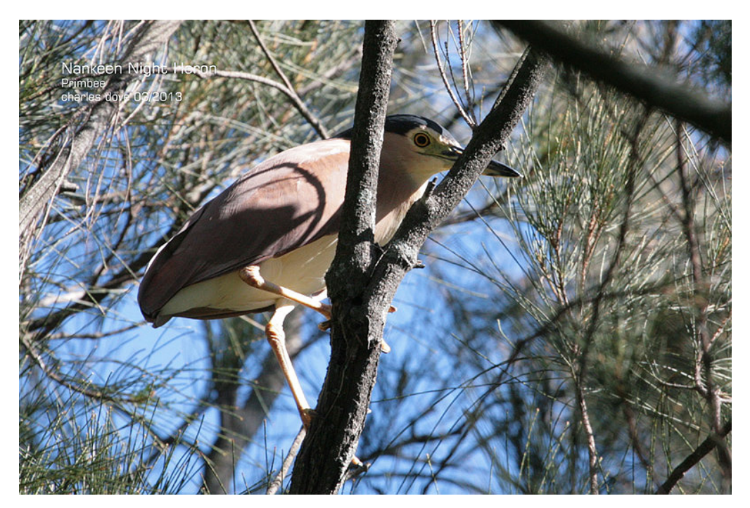
Figure 2.9.3. Nankeen Night Heron (Nycticorax caledonicus).