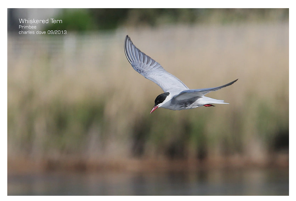
Figure 2.9.8. Whiskered Tern (Chlidonias hybrida).

little pressure per square centimetre and enabling it to walk on floating vegetation without having the vegetation sink beneath it. A female Comb-crested Jacana may mate with several males, while the male alone builds the nest, incubates the eggs and cares for the young. The male also has a remarkable behaviour of tucking its young under its wings to carry them out of way of danger if the need arises. The nest is a raft of grass and plant stems, moored amongst floating vegetation such as lilies.