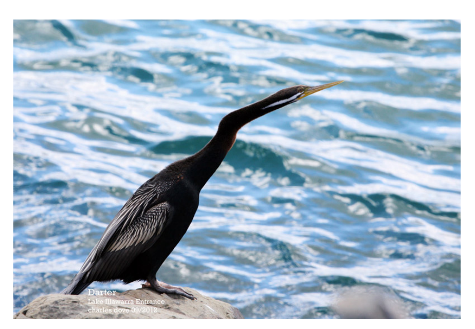
Figure 2.9.1. Darter (Anhinga novaehollandiae).

The Australian Pelican feeds mainly on fish but also crustaceans and occasionally on amphibians, small birds or carrion. They are capable of long flights and may soar at 3000 m or more especially on afternoon thermals, giving them an ideal perspective of surrounding wetlands and food sources.