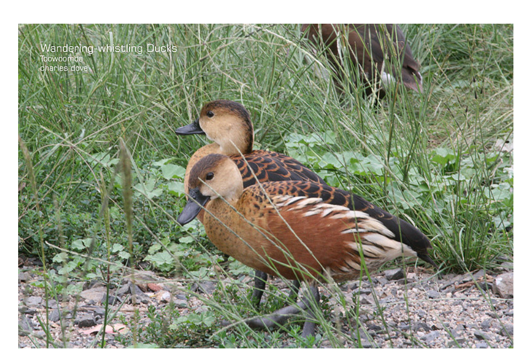
Figure 2.9.6. Wandering Whistling Ducks (Dendrocygna arcuata).

Hardhead ( Aythya australis ) (Figure 2.9.5), Musk Duck and Blue-billed Ducks ( Oxyura australis ) are seldom seen on land. Hardheads are usually found on large swamps with plenty of reed beds, but are also found on lakes, coastal swamps and sewage farms (Straw 1997). Until 1900, Hardhead outnumbered all other waterbird species on the coasts of New South Wales and Victoria. Numbers have since declined and it is now much less common on the coast of New South Wales. Many Hardhead now rely on the Murray-Darling basin; however, this species is largely nomadic (Serventy et al. 1985).