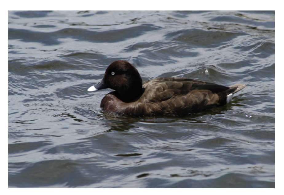
Figure 2.9.5. Hardhead (Aythya australis).

fringed by abundant aquatic vegetation. Breeding is synchronised with flooding rains, and the bird nests in the hollows of trees standing in water.