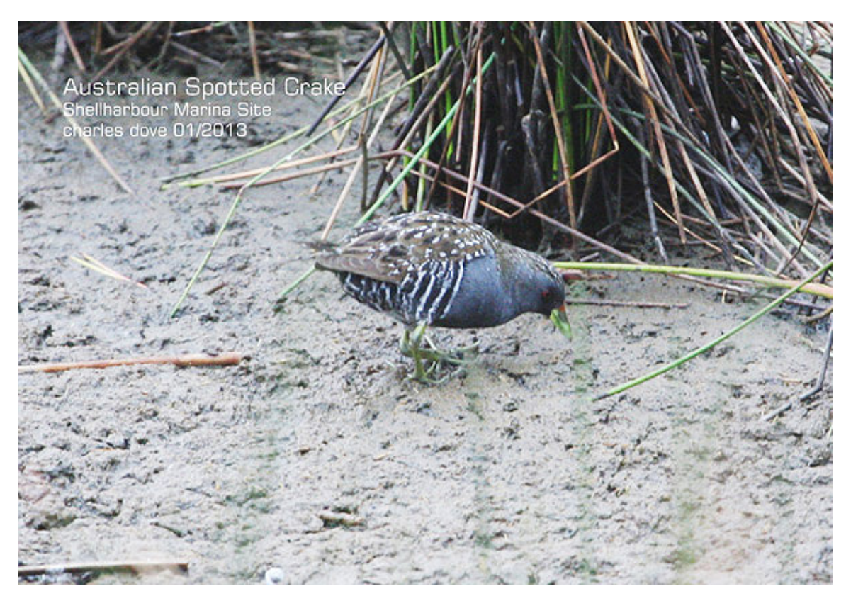
Figure 2.9.7. Australian Spotted Crake (Porzana fluminea).

of wetlands or parks feeding on grasses, seeds or invertebrates. The Purple Swamphen has the unusual habitat of grasping stems of aquatic plants with its foot while eating them. They particularly like the fresh tender new growth, sometimes encountering the wrath of groundsmen of parks and gardens or wetlands landscapers. The Eurasian Coot is more gregarious than gallinules and is more likely to be found on open water, where it often dives to feed on submerged vegetation and can spend a minute or more submerged.